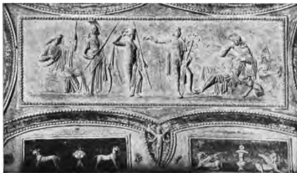
Fig. 32. Judgment of Paris.

Fairest." Hera, Athena, and Aphrodite each claimed the apple. Unwilling to expose himself to the storm of wrath a choice among the three would raise, Zeus sent them to appear for judgment before Paris. This Paris, the son of the king of Troy, had been exposed as an infant and brought up among shepherds, and was now keeping his sheep on Mt. Ida. The three goddesses came before him, arrayed in all their charms, and